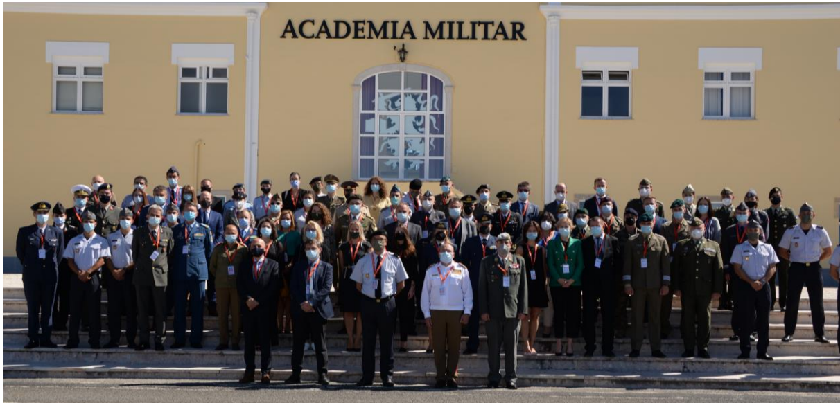
Picture 3: The iMAF participants at the Portuguese Military Academy in 2021.

within seven syndicates on needs for the lines of development. A further syndicate, composed of Officer Cadets, gave a feed-back concerning their experiences about exchanges. Such syndicates are important as well, can be seen as a kind of quality assurance system, and is the reason, why our main target group – the Officer Cadets and students – should always be involved in future iMAFs.