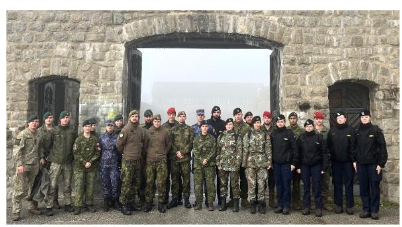
International Semester in front of the former Nazi-concentration camp Mauthausen.

In November 2024, participants from the international winter alongside semester. Austrian cadets united in a profound exploration of history at the Mauthausen concentration camp memorial in Austria. This site, etched into the collective memory of the Holocaust. served as a stark reminder of the atrocities committed during World War II and the enduring necessity to confront humanity's darkest moments.