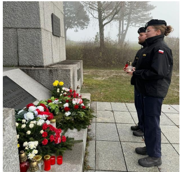
Polish midshipmen at the memorial of Polish victims.

atrocities committed at Mauthausen, its haunting silence offering a powerful reminder of the lives cut short. The names of Polish patriots, Austrian citizens, and countless others