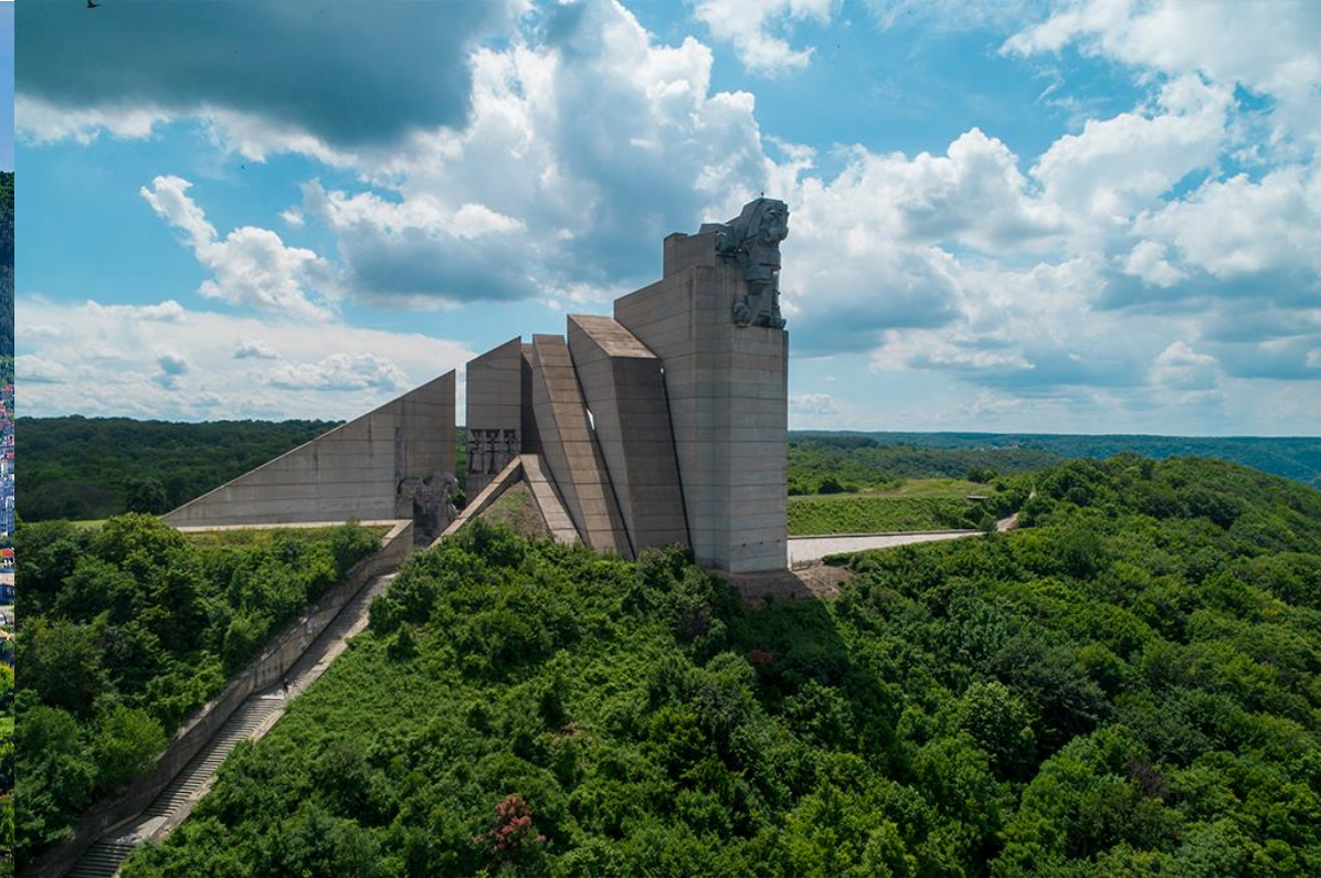
FOUNDERS OF THE BULGARIAN STATE Memorial Complex