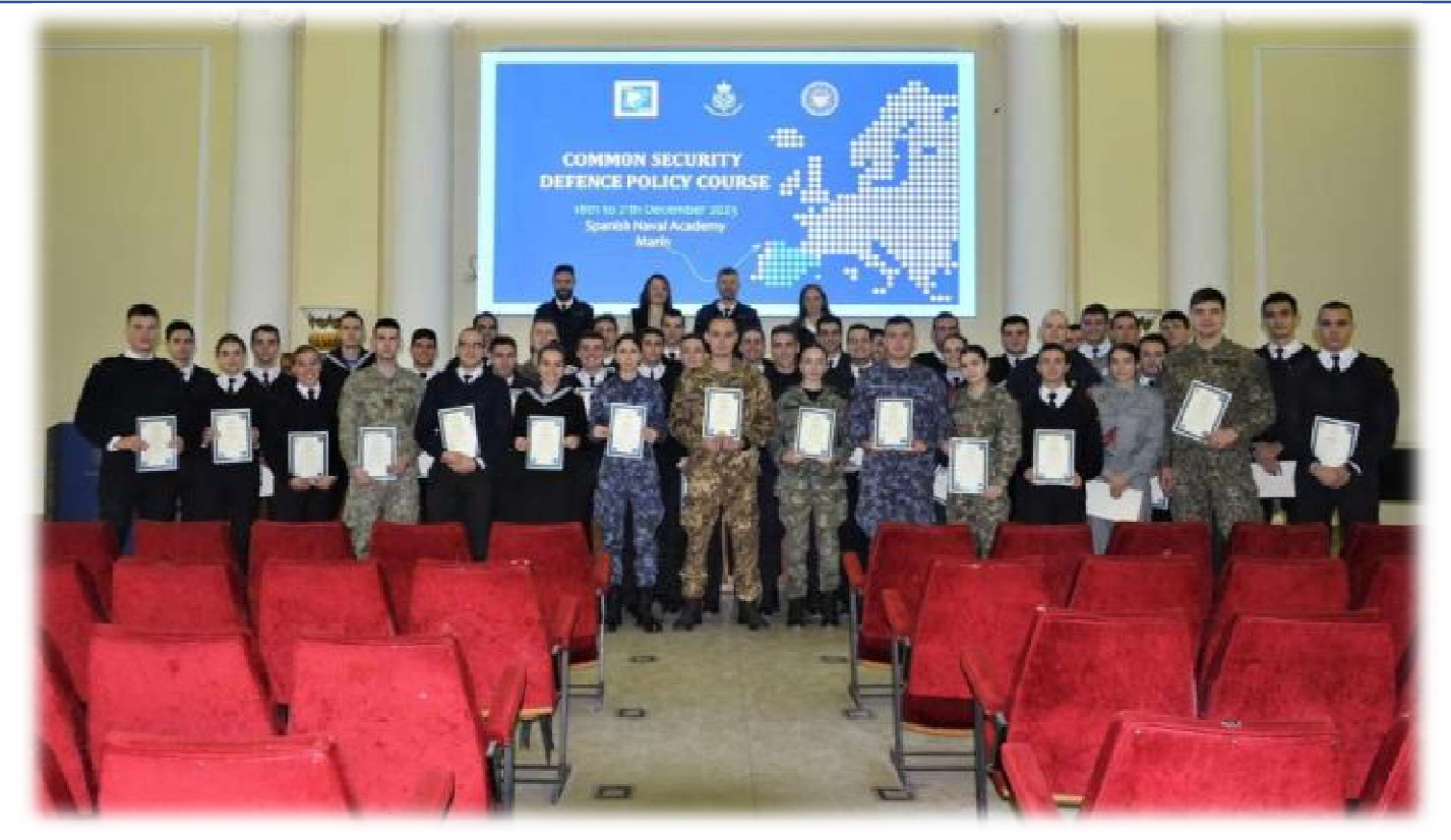
Mon 16th - Thurs 19th dec 24