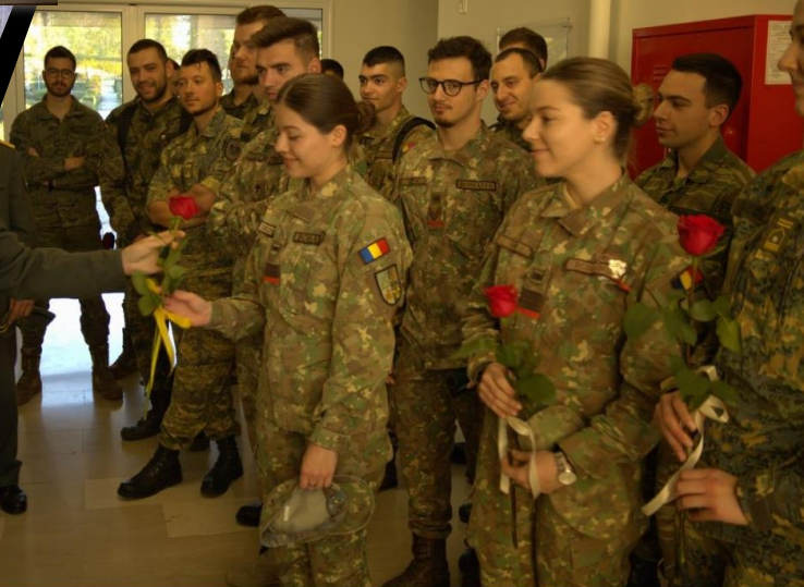
International Women's Day Event