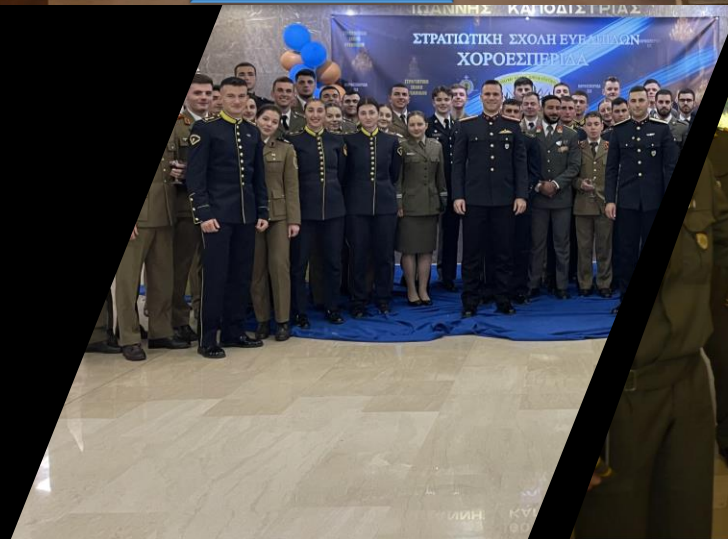
4 th Year Cadets Ball