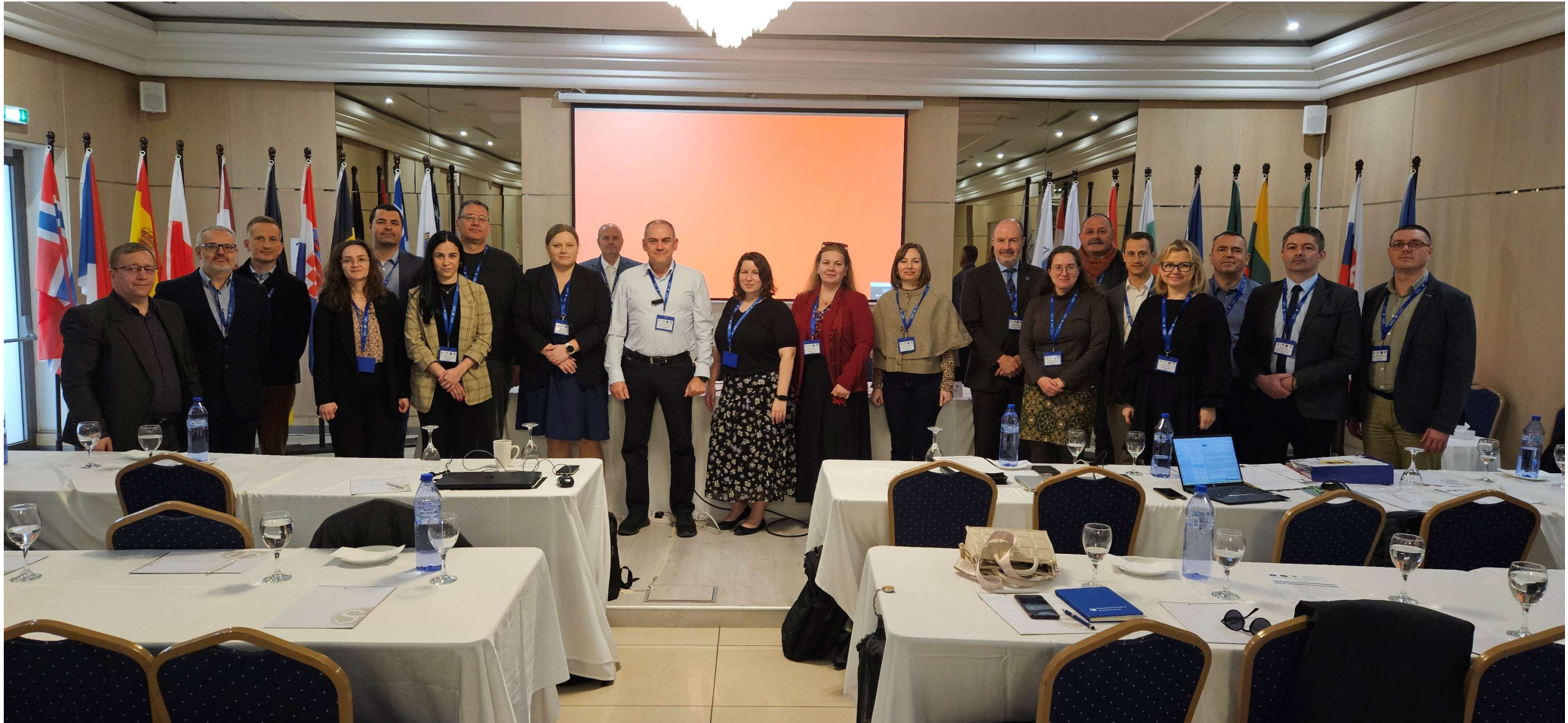
Participation – 21 participants from Poland, Romania, Austria, Czech Republic, Spain, Slovakia, Bulgaria and Hungary.