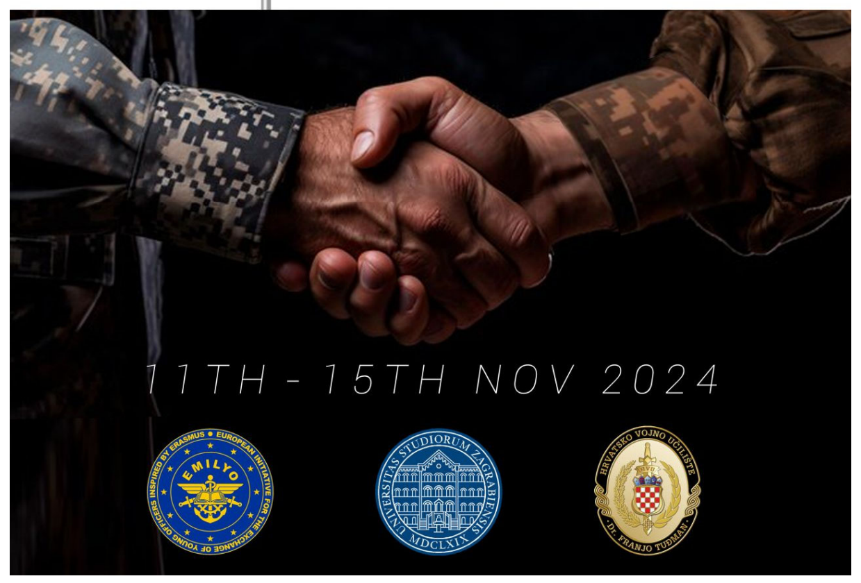
Common Module "Cross-Cultural Communication" in Croatia

For the first time, the Cammon module "Cross-Cultural Communication" of the European Security and Defence Collage was held at the Croatian Defence Academy "Dr. Franjo Tuđman" as part of the European Initiative for the Exchange of Young Officers (EMILYO).